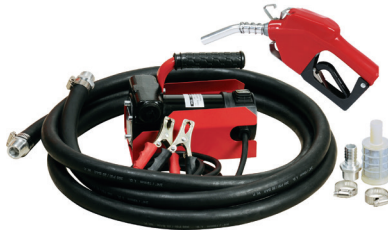
12V DIESEL PUMP KIT - AUTOMATIC NOZZLE L-FPA12V