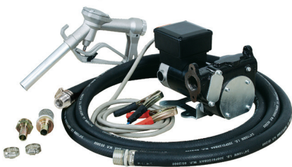
12V HIGH FLOW DIESEL PUMP KIT - MANUAL NOZZLE L-HFFPM12V