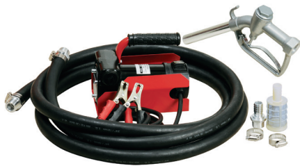
12V DIESEL PUMP KIT - MANUAL NOZZLE L-FPM12V