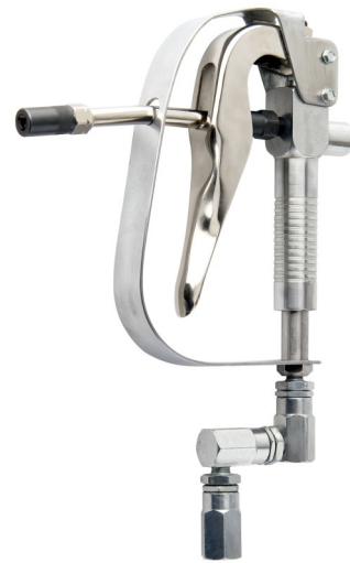
Shown with optional trigger guard

Grease is being dispensed at high pressure. Keep your hands away from the nipple (zerk) / coupler connection at all times.