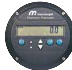
Deluxe LC Display