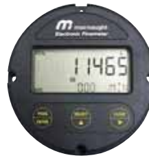
Standard LC Display