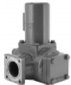
MS1243 Air Eliminator

The Macnaught MS1243 series air eliminator mechanism is a reed curtain valve consisting of two stainless steel reed strips operating in conjunction with a valve plate. One end of each reed is fastened to a float and the other is attached to the housing. The counter balancing reeds allow the float to have maximum sensitivity of air or vapor present in the system. The float assembly is normally closed when air or vapor is absent from the liquid. The float assembly opens when free air or vapor accumulates in the housing. The displacement of the air or vapor lowers the liquid level within the housing, dropping the float and releasing the air or vapor out of the orifice on the valve plates. The efficient design of the float and valve plate assembly allow the air eliminator mechanism to operate at zero or maximum pressure, without stress or fatigue. The MACNAUGHT MS1243 air eliminator mechanism will release approximately 80CFM (cubic feet per minute) at full capacity.